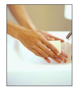
1) Wash & dry hands and undress from the waist down