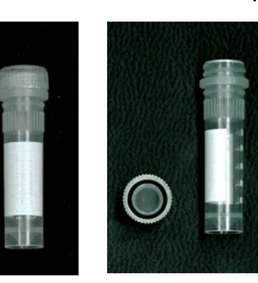
2) Remove cap from vial and set aside