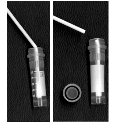
7) Bend back and forth, then place finger on bent shaft so swab does not come out. Break off swab shaft. (Swab stays in vial)